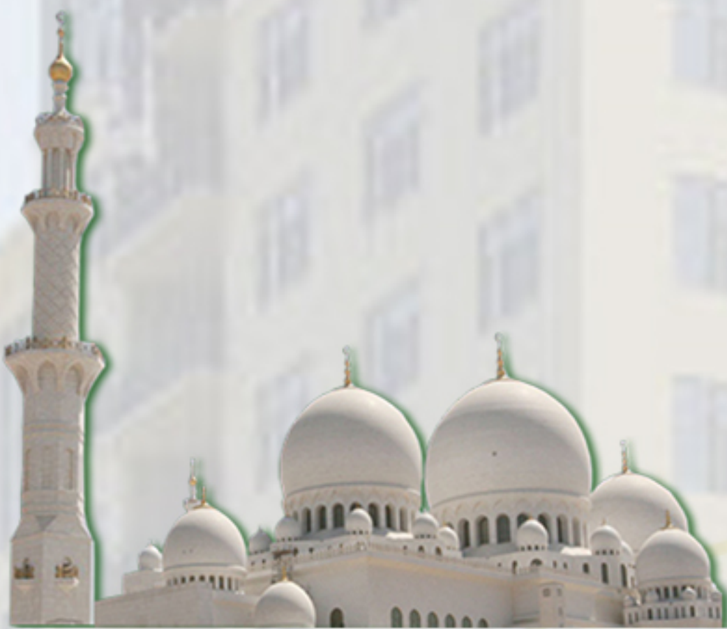
A beautiful mosque at the center place