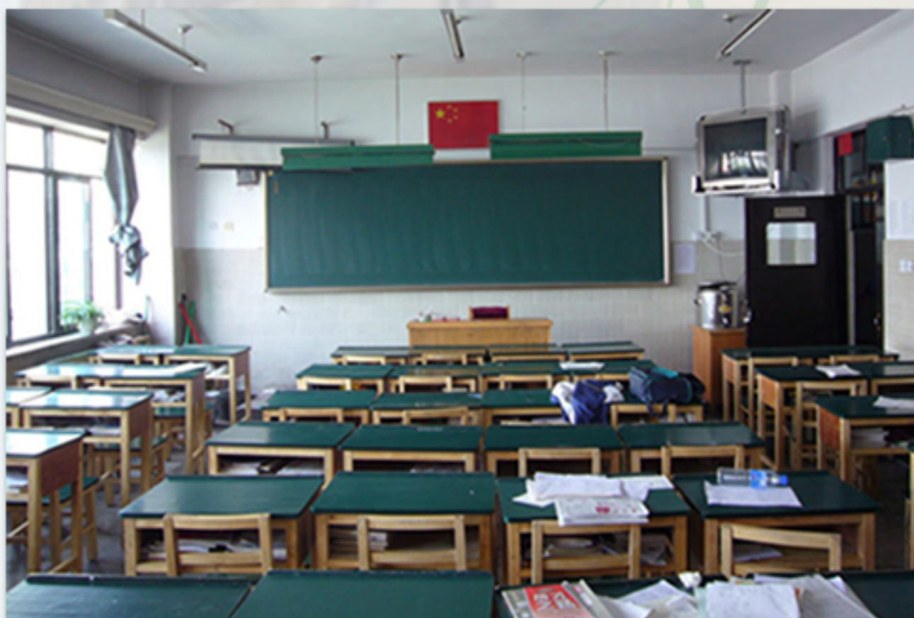
School for Children