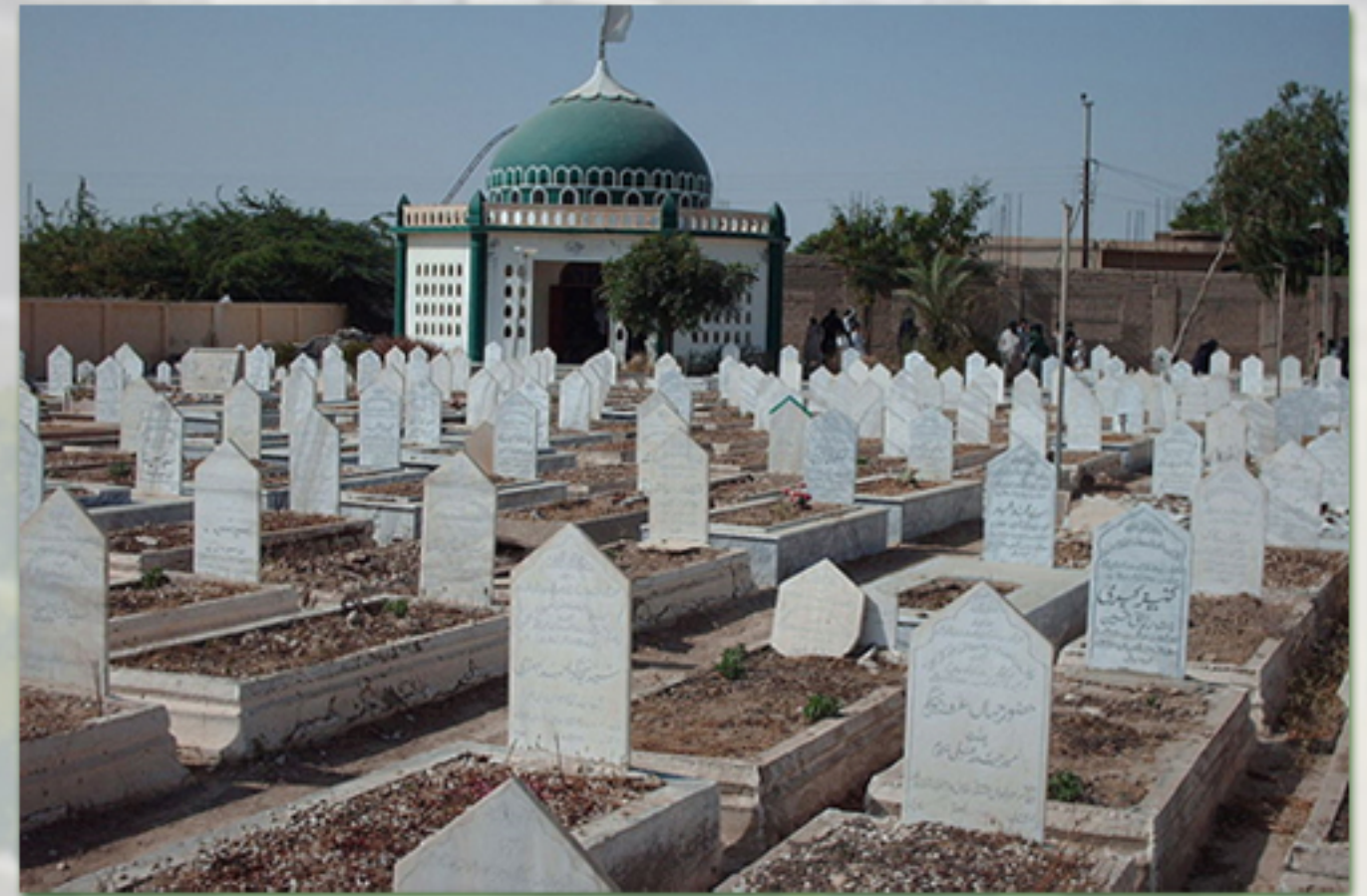
Kabristan for the ultimate destination of the society